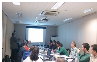
Efficient Facilities Course

Twenty professionals from all over Spain participated.