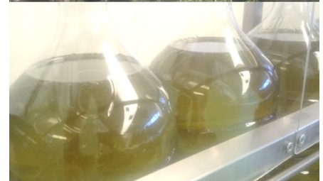
Olives cultivation and production of olive oil that complies with PEF