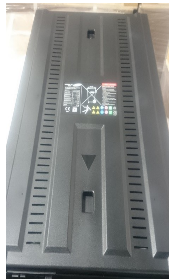
Lithium Ion batteries for a 10 MW commercial project

The sizing of the Ion-Lithium storage systems, which can range from less than one MW to more than 20 MW, depends mainly on the market conditions and the existing remuneration, in addition to the technical conditions to fulfil the services for which it is designed.