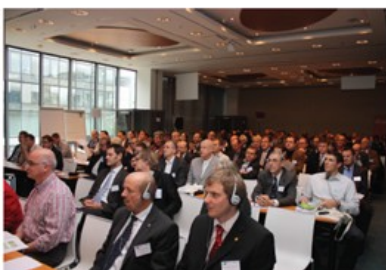
European Energy Managers

The next edition 2018-2019 will begin in the month of October and registration is now open at www.escansa.com