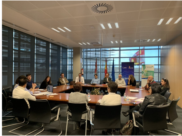
Regional group meeting of “Stakeholders”, January 2020

In June, the 2nd Videoconference Meeting was held to present the progress of the project included in the Energy Support Map.