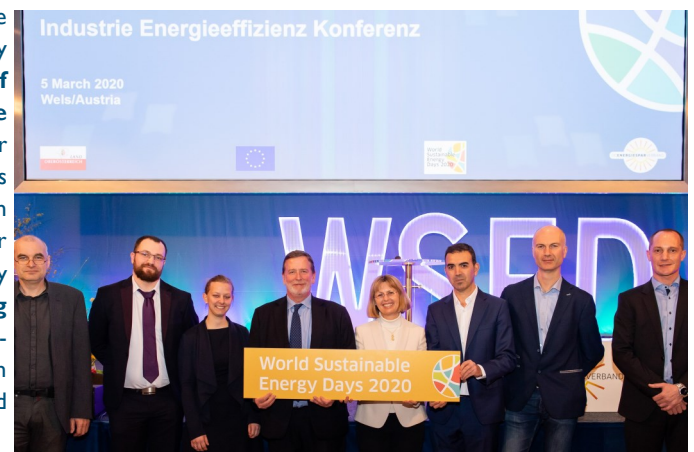
WSED 2020, March 2020

The project lasts until 2022. Industrialists in the IAB sector who are interested in improving their cooling systems, as well as industrial specialists interested in improving their knowledge of energy efficiency, can obtain more information through the project website www.iccee.eu