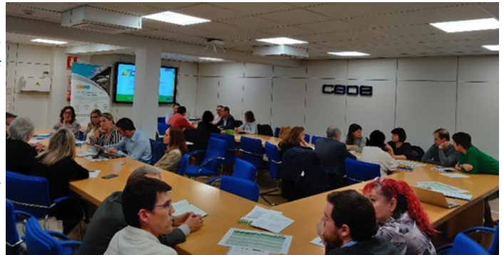
Project workshop January 2020

The conclusions of the event have been included in a report sent to Brussels along with those obtained in a similar way in the other participating countries.