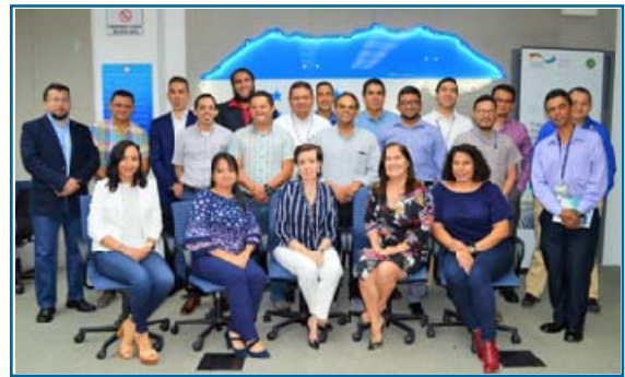
Institutions participating in the program

The presentation and socialization of the preliminary results has been carried out in the month of May 2019 with the presence of the national representatives.