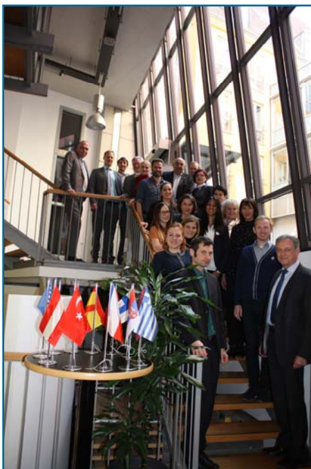
Meeting of European partners.

Participants in the training project of energy managers met in Belgrade presenting the first activities of the EUREMnext project in each country .