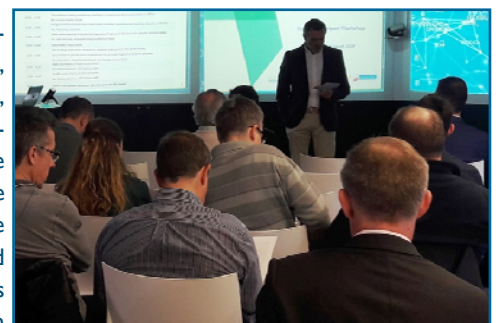
Experiences exchange workshop

The energy projects related to smart mobility, tourism, road lighting, smart buildings and services for citizens have been in the focus of the topics analyzed and the conclusions will be used to make improvements both in Santander and in cities of other countries.