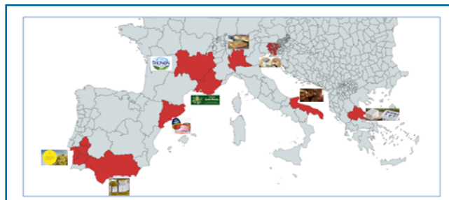
Regions participating in the PEF—MED Project

In Spain, the companies OLEOCAMPO (olive oil) and ARGAL (meat) participated as a pilot to apply the results and promote their market strategies.