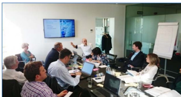
Discussion of practical issues.

“This course is an exemplary case of EC support to obtain good results”.