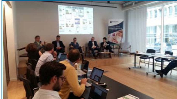
Final event of the Digi-Label project. Brussels.

The European Commission presents, for the first time to the public, EPREL register of products with energy labelling that includes, from washing machines and dishwashers to ovens or air conditioners. The products manufacturers and distributors have been incorporating the models in the database since 2018.